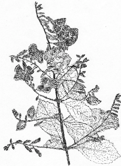
Duranta sp. "Geisha Girl"

Purple flowers, yellow poisonous berries, thorns.