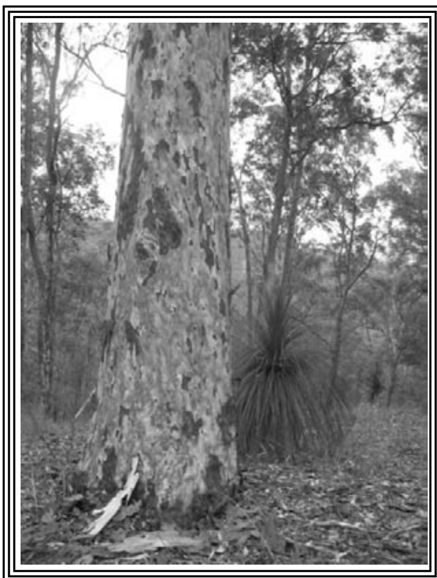
Corymbia citriodora subsp. variegata

Community news from Mt Nebo and Mt Glorious www.gloriousnebo.org.au/MTN/